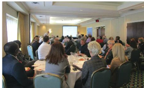
Leaders' Forum Workshop