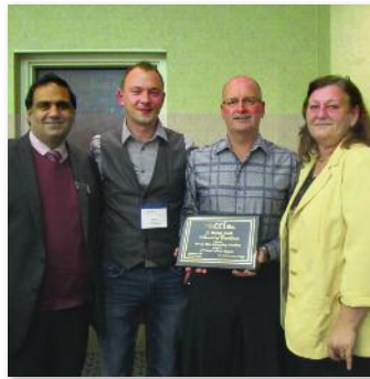
Tier 2 – CCI North Alberta Chapter