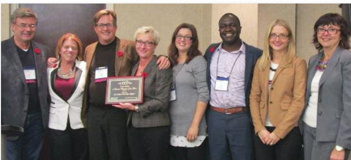
Tier 2 – CCI Golden Horseshoe Chapter