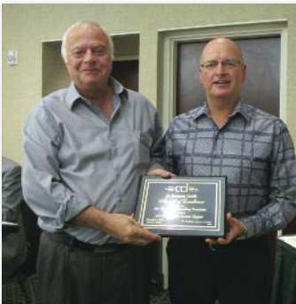
Tier 1 – CCI South Saskatchewan Chapter