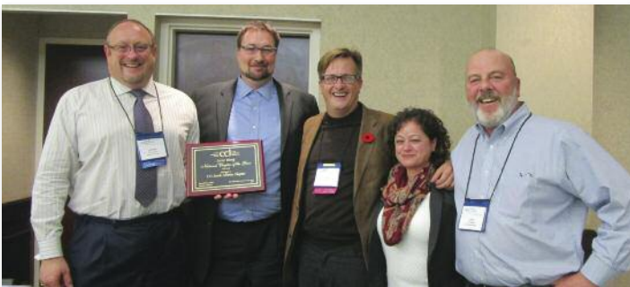
Tier 1 – CCI South Alberta Chapter