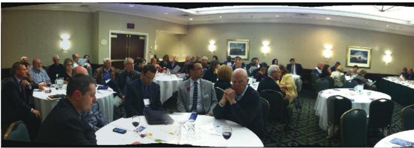
National AGM Attendees